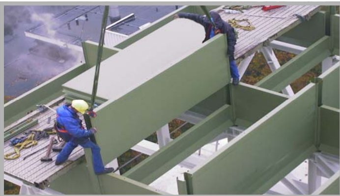
Mounting totally smooth-wall silo block without bolts.